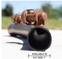
AVAILABLE IN 3/4" AND 1"